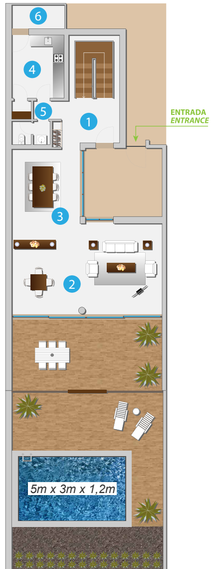
PISO TÉRREO - GROUND FLOOR